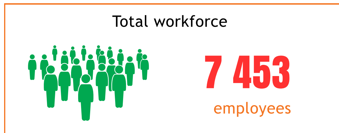
Distribution by age (total workforce)